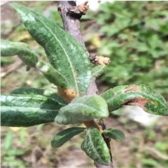
Fig. 1 : Seabuckthorn plant showing leaf spot